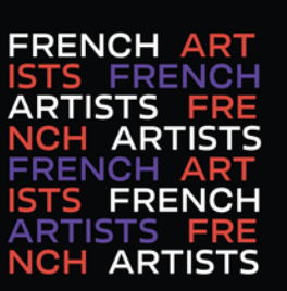
<u>French Artists</u> Available on Marmoset